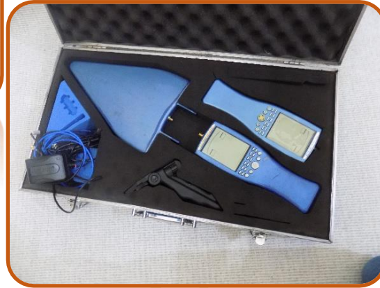
EMF Spectrum meter and Analyzer