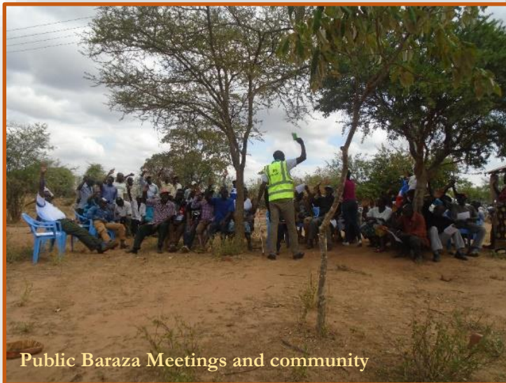
Public Baraza Meetings and community