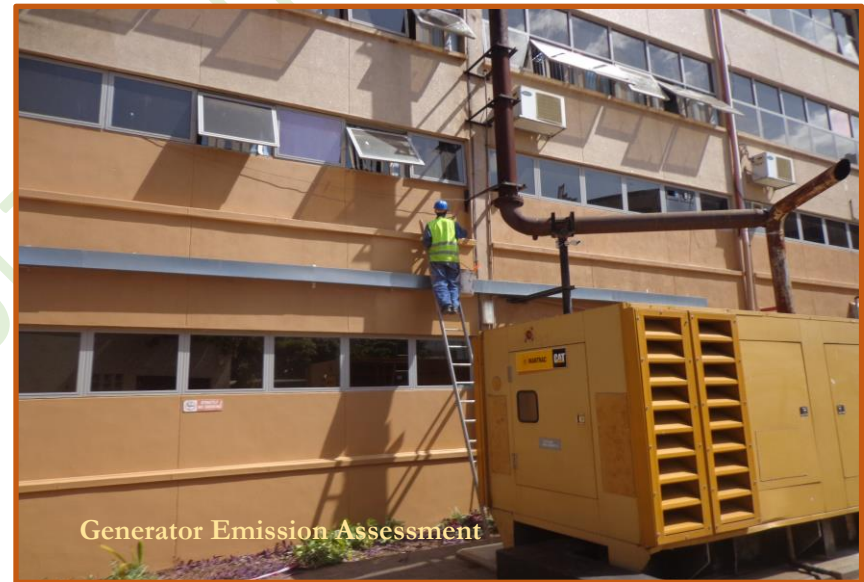
Generator Emission Assessment