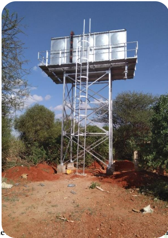
Elevated Water Tank at Arabia Boys Secondary School in Mandera County