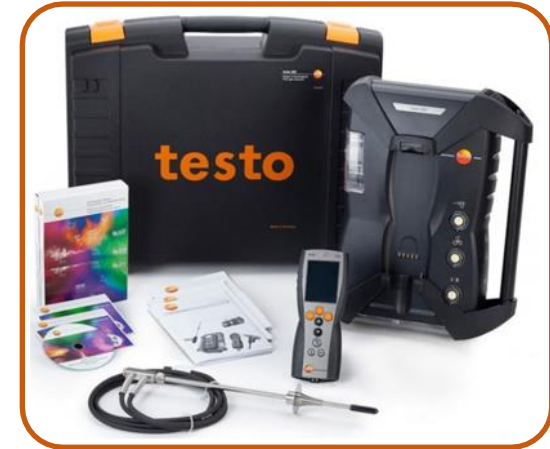
Flue Gas Analyzer