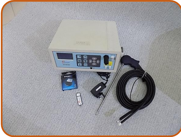
Indoor Air Quality Analyzer